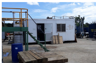
Mobile Laboratory Port Villa

During 2018 Road Science Laboratory staff provided Laboratory Design and Testing Services to the Urban Roads and Drainage Phase 1 contract. A laboratory was established beside the Downer Mobile Asphalt Plant. The laboratory was moved over to Santo Island to provide laboratory services for the Santo-Pekoa Runway for a two month period.