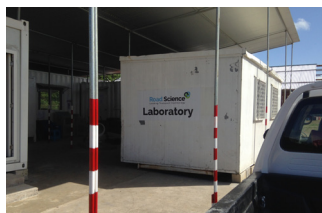
Mobile Laboratory Santo Island

In July 2018 the Road Science Laboratory team signed an agreement with the joint venture partners China Civil Engineering Construction Corporation (South Pacific) (CCECC) and Northwest Civil Aviation Airport Construction Group (NWCAACG) to provide IANZ-accredited Laboratory Testing and Technical Services for the Santo -Pekoa and Bauerfield Runways. This was a World Bank, Pacific Aviation Investment Program (PIAP) Project. Road Science provided a technical governance service that ensured our client (CCECC) met contract specification,